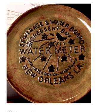
Watermeter Jan. 20

Come out for a fun night of painting ceramics. The pattern will applied for you, no drawing needed. Anyone can do it! All supplies included. Workshops are held on Fridays from 6:00 p.m. - 9:00 p.m. at Fassbender Center. Workshop fee: $20. Instructor: Toni Bacino