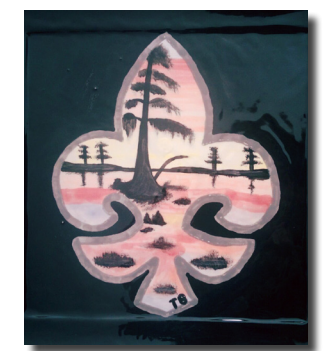
Louisiana Bayou Mar. 24